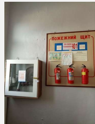
9: Fire-fighting equipment