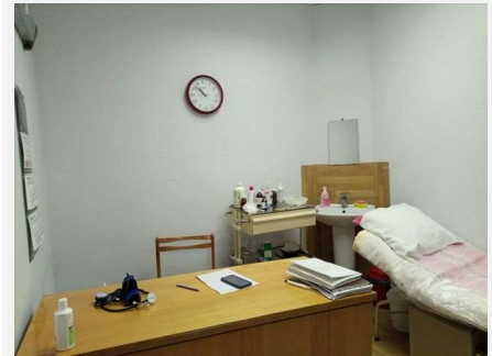
12: Medical room