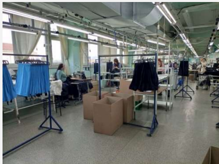
4: Production hall 2