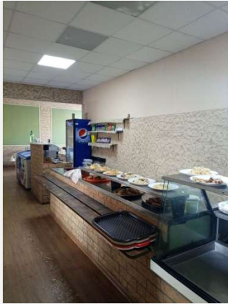
16: Kitchen facilities