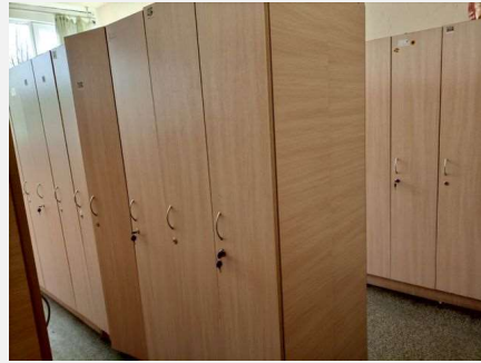
17: Changing room