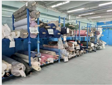
2: Warehouse of incoming materials