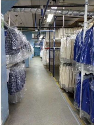
7: Finished goods stored