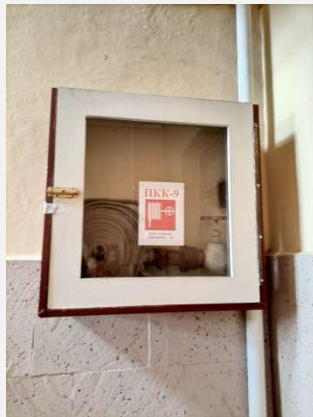
10: Fire hose