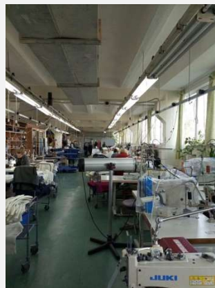
5: Production hall 3