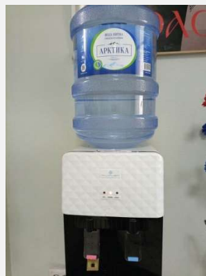
14: Potable water