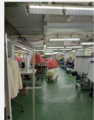
6: Production hall 4