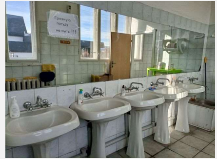
18: Washing facilities