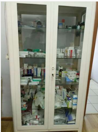
13: Medical storage