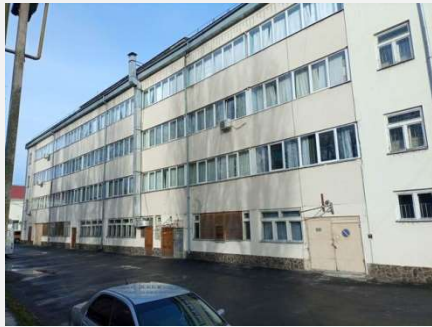
1: Facility's building

Photos relevant to the factory visit and findings, taking into account client-specific requirements for photos to take and report. If providing photo evidence of records, please consider sending a separate file in .pdf that is large enough to read the records (e.g., to document inconsistent records).