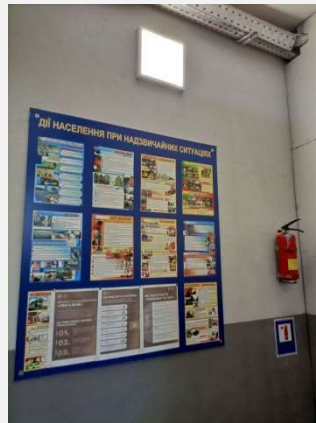
8: Safety instructions