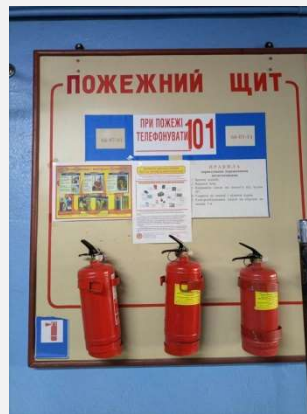
11: Fire-fighting equipment