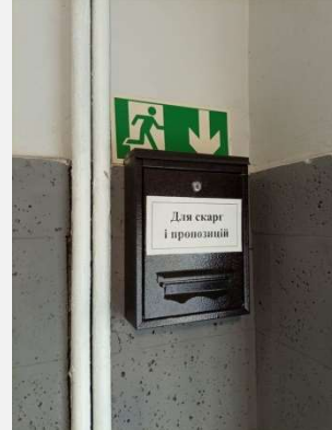
21: Suggestion box