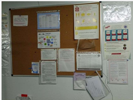
22: Social info board