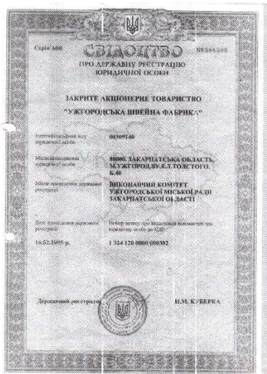
23: Business License